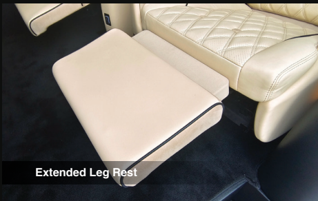
Extended Leg Rest