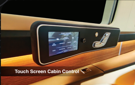
Touch Screen Cabin Control