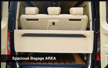
Spacious Baggage AREA