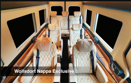
Wollsdort Nappa Exclusive