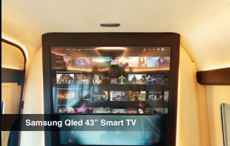
Samsung Qled 43" Smart TV