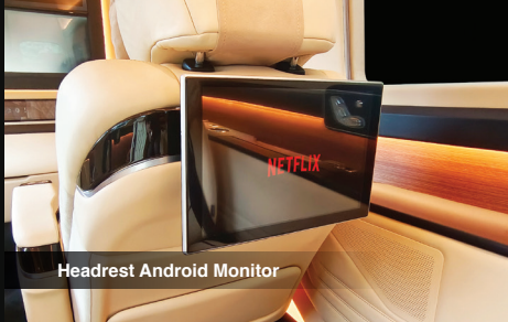
Headrest Android Monitor